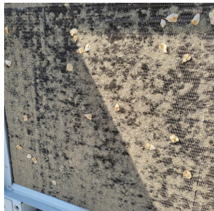
Contamination of condensers