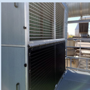
Intake grilles LBK