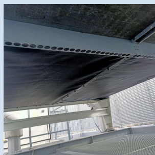
Table Model Drycoolers