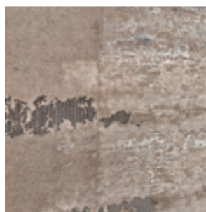
Contamination of condensers